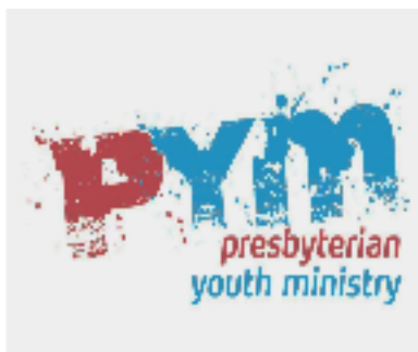
PRESBYTERIAN YOUTH MINISTRY