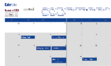
STAY UP TO DATE

To see the Synod & Presbytery calendar online, click here