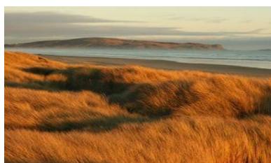
CONNECT Conference April 2 First Church, Invercargill

Connect is the annual National Presbyterian Youth Ministry leaders gathering. It's all about training, connecting, & growing. This year it will be extra special as it is being held in Ohope at the PCANZ marae.