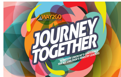
Way2Go May 25 Mosgiel Presbyterian Church

A mix of inspirational speakers, practical workshops, and networking opportunities, which will equip you for your work with children and young people.