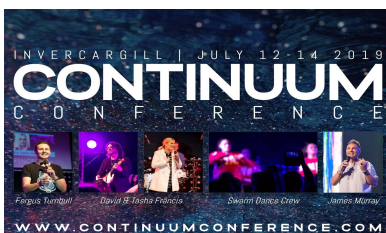
Continuum Conference July 12-14 Windsor Church, Invercargill