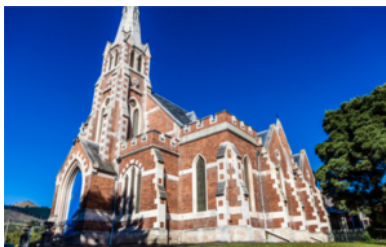
South Island Ministry Conference May 14th -15th East Taieri Presbyterian Church

A conference for everyone and anyone in ministry. An opportunity to grow and be challenged and to connect with other folk in ministry. Always a great event!