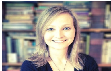
Faith & Adolescence Workshop May 16 Ascott Park, Invercargill

Churches are struggling to keep their teens connected to faith. This workshop will speak into this challenge with hope and encouragement for parents, pastors and youth workers.