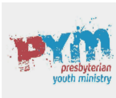
PRESBYTERIAN YOUTH MINISTRY