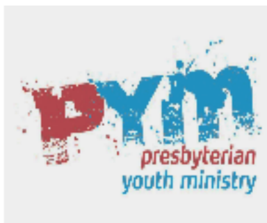
PRESBYTERIAN YOUTH MINISTRY