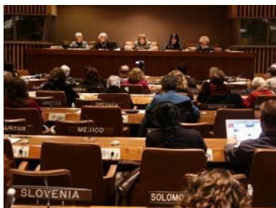
BUSH FIRE NEWSLETTER