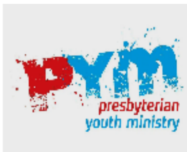
PRESBYTERIAN YTH MINISTRY