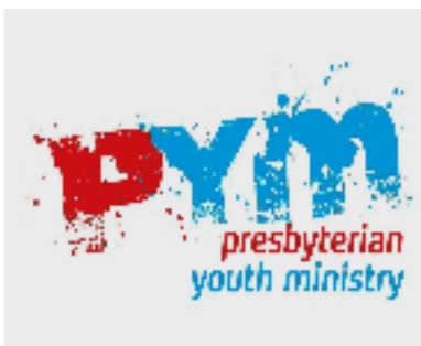
PRESBYTERIAN YTH MINISTRY