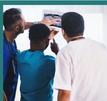
Vacancies - Hospital Chaplaincy