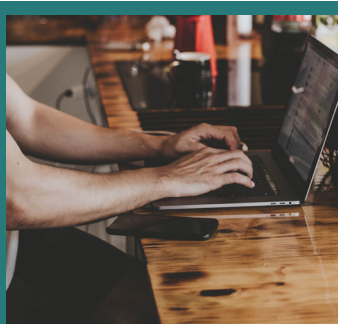
Special Assembly Website