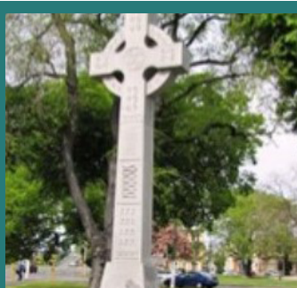
Faith Thinking on Zoom