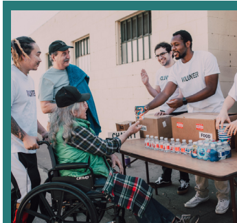
Vacancy - PSO Community Mission Liaison