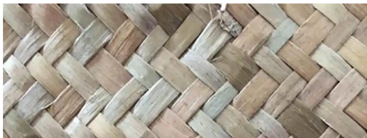
PCFM WOVEN Term 2 Update

Praying for Children Week 2022 Anchored Retreat SUPAKidz Mega Makers Camp One Conference