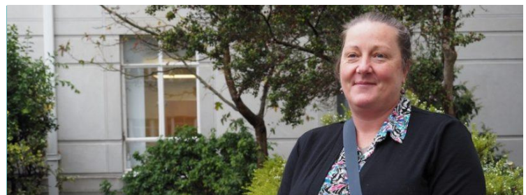
Encouraging Hospital Chaplains