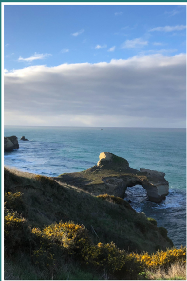
Dunedin North Otago Regional Group 2023