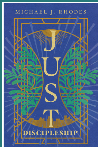
Seminar - Biblical Justice in an Unjust World