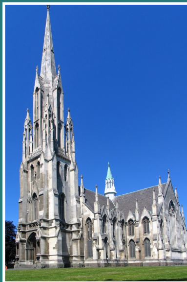
First Church of Otago 175 Birthday Party