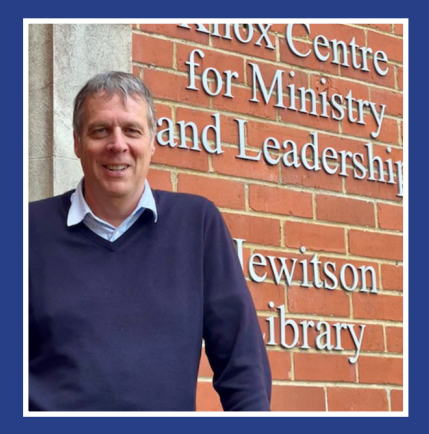
Preaching Workshop Hawea Flat