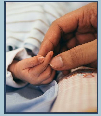
Dunedin Hospitals Māori Chaplain