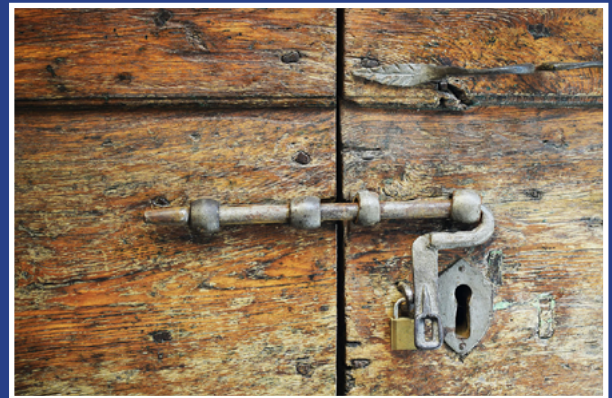
Tokarahi Church Final Service