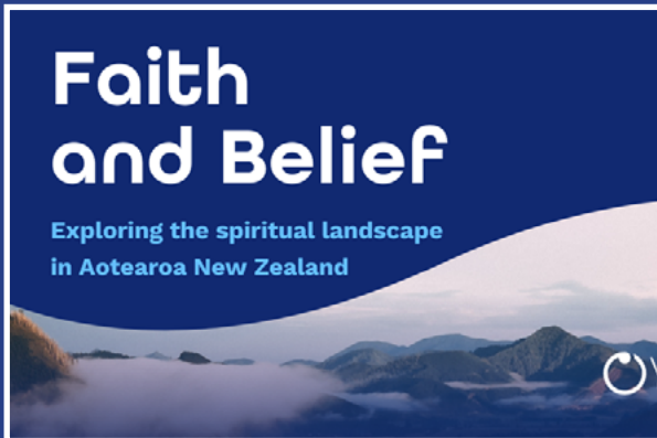
Wilberforce Faith and Belief launch