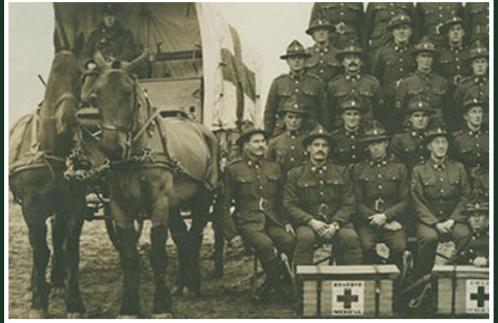
Presbyterian Research Centre Volunteer Drive