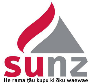
Scripture Union Conf 25 th May