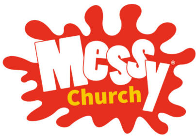
Messy Church Training 14 th - 25 th May